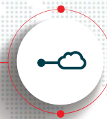
Microsoft Azure Peering Service